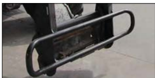
Anti-swing bag stabilizer- increases stability