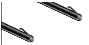
4 non-damaging bag stops- improved safety